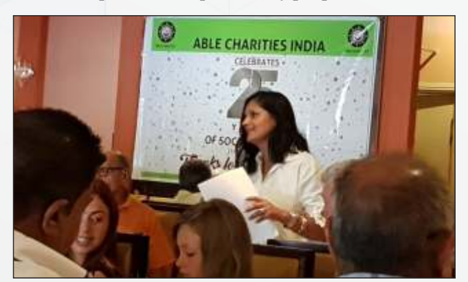
ABLE CHARITIES Organised at Nottingham England Annual Report, Year 2018 • Able Charities | 8