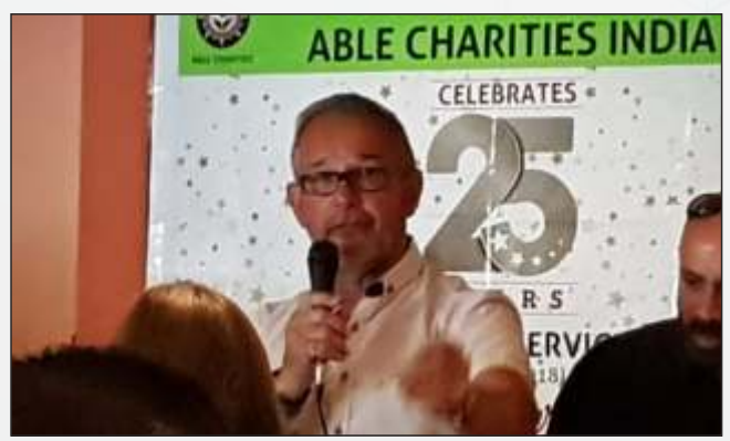
Some of the guests in London Charity Dinner- July 2018

One Kind Act London donated 6000 pounds for free Eye Cataract Operation for poor needy people at Palwal.