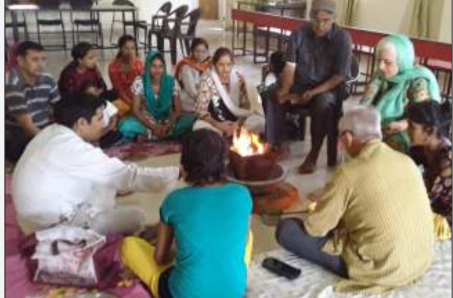
Havan @ ABLE PREM Ghar - New Year