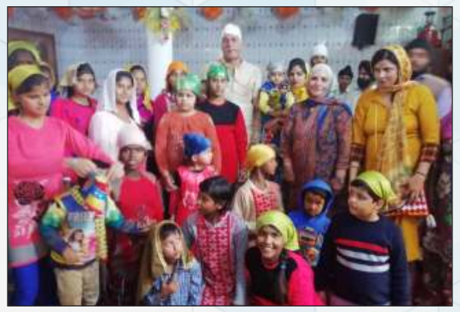
PREM Ghar Girls @ Gurudwara on GuruPurab