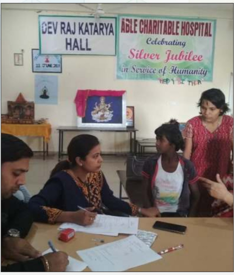
Eye Camp organised by ABLE Charitable Hospital Health Check up @ Prem Ghar