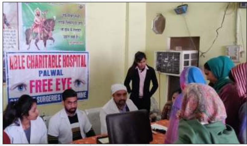
Free Eye check up camp organised by ABLE Charitable Hospital

Preventing Health Campus - To make the general public aware on different health issues we organize 300 medical campuses, covering the approximately 80 villages of Faridabad, Palwal, Nuh and Mewat district.