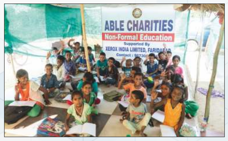
XEROX India is the Indian subsidiary of Xerox Corporation, based in Gurgaon, India the American printer, Photocopier, Document supplies, Technology & Services Company. In 2018 XEROX started supported ABLE CHARITIES Non Formal Program with the comprehensive way addressing the health, nutrition's, education and ensuring active parenting.

In 2011, ABLE India took an initiative to start non formal education centers in different slums of Faridabad with the objective 'IF A CHILD CANNOT GO TO SCHOOL, LET THE SCHOOL GO TO THE CHILD'. At present, ABLE is educating 700+ slum dwelling children in 8 centers across Faridabad. These centers provide need based educational services to the marginalized children & 450+ children are given nutritious Mid-Day Meal every day.