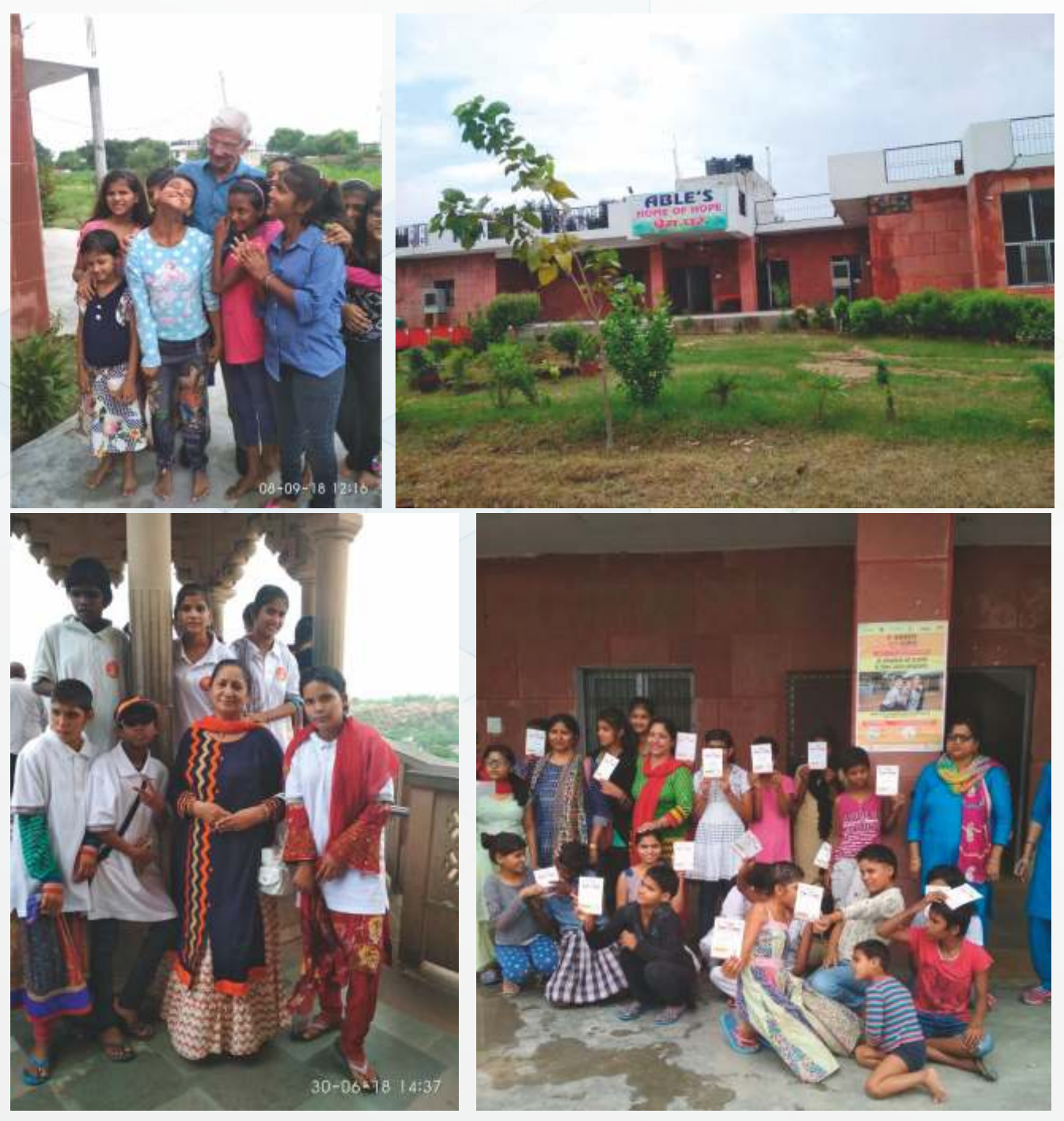
PREM GHAR Girls gone to Vrindavan Temples.

On 6th June 2017 we were able to make our own home for girls. We got 29 girls from a very derelict home for better living and of course, better medical and education to girls. All this as if a dream has come true. PREM GHAR is for 80 Girls full time residential facility.