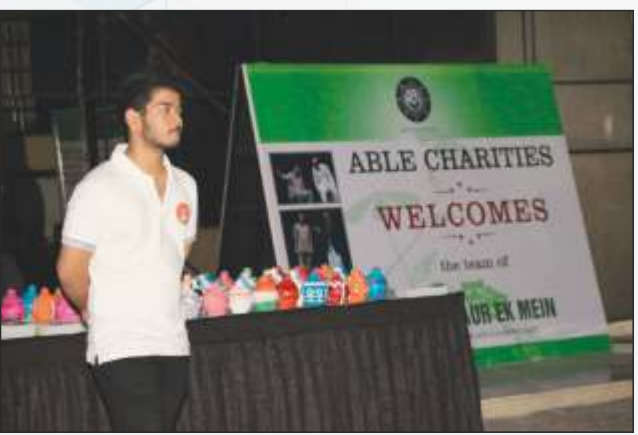
Annual Day Celebration-2016