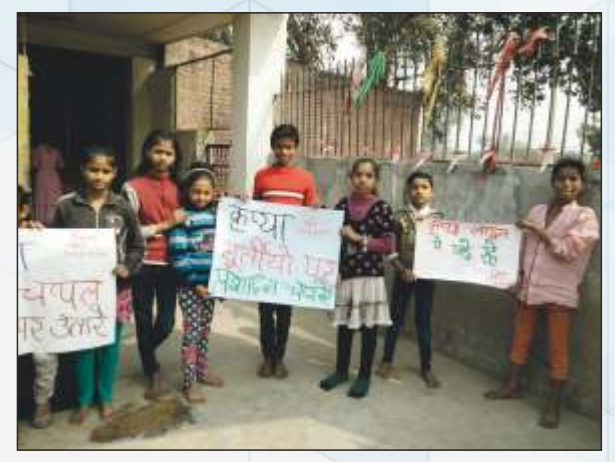
Our children from non-formal education centers on cleanliness drive Providing Non-Formal Education to Children in slums of Faridabad

The story of ABLE Charities is a saga of service, honesty, compassion and love for the downtrodden including orphans, poor widows, their children, and slum children. Set up in 1993 in a single 150 sq. ft. room, in a remote village Mitrol, Palwal (Haryana) on NH-2. about 75kms from Delhi (on way to Agra), ABLE Charitable Hospital has grown to being a 50000 sq. ft. 100 bed hospital. ABLE is an international registered charity, registered in UK and US as a non-profit organization. ABLE serves women, especially widows, their children and orphans. Having treated over 4,00,000 patients till date and currently we conduct over 700 major surgeries annually. ABLE supports and provides free education to 1300 orphans, children of widows and underprivileged children living in the villages around Palwal and in the slums of Faridabad. At ABLE, we endeavour to create awareness and sensitize both urban and rural society on various social issues through our different programs and events.