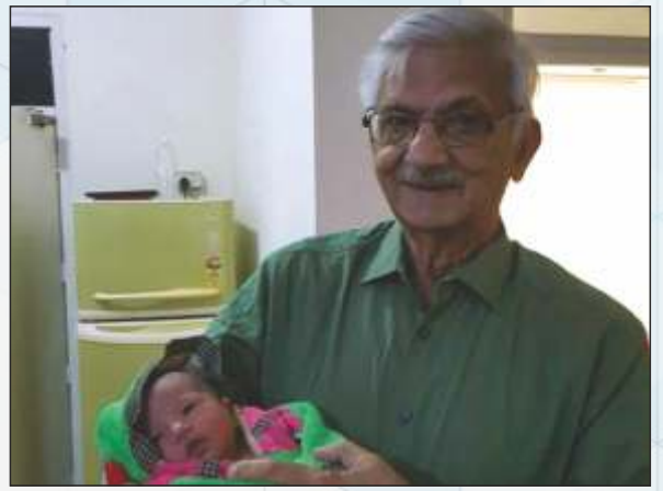
Our Chairman with newly born girl rescued by ABLE

The story of ABLE Charities is a saga of service, honesty, compassion and love for the downtrodden including orphans, poor widows, their children, and slum children. Set up in 1993 in a single 150 sq. ft. room, in a remote village Mitrol, Palwal (Haryana) on NH-2. about 75kms from Delhi (on way to Agra), ABLE Charitable Hospital has grown to being a 50000 sq. ft. 100 bed hospital. ABLE is an international registered charity, registered in the UK and the US as a non-profit organization. ABLE serves women, especially widows, their children and orphans. Having treated over 5,00,000 patients till date and currently we conduct over 700 major general surgeries annually. ABLE supports and provides free education to 1400 orphans, children of widows and underprivileged children living in the villages around Palwal and in the slums of Faridabad. At ABLE, we endeavour to create awareness and sensitize both urban and rural society on various social issues through our different programs and events.