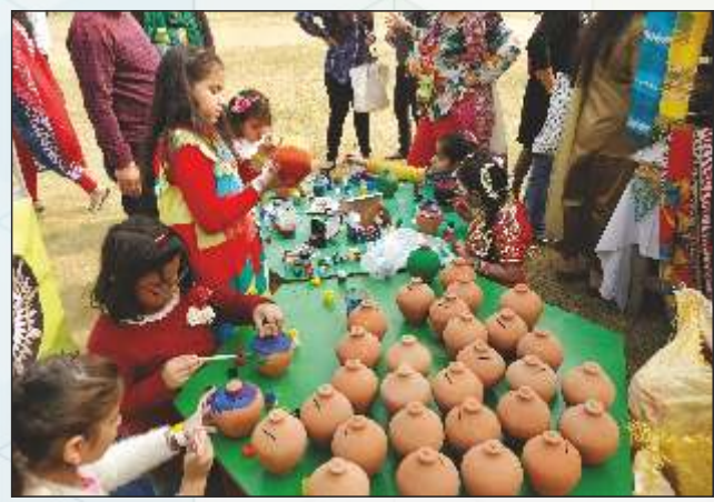
One of the efforts out of various fund raising activities-Gulak (Piggy Bank) Project