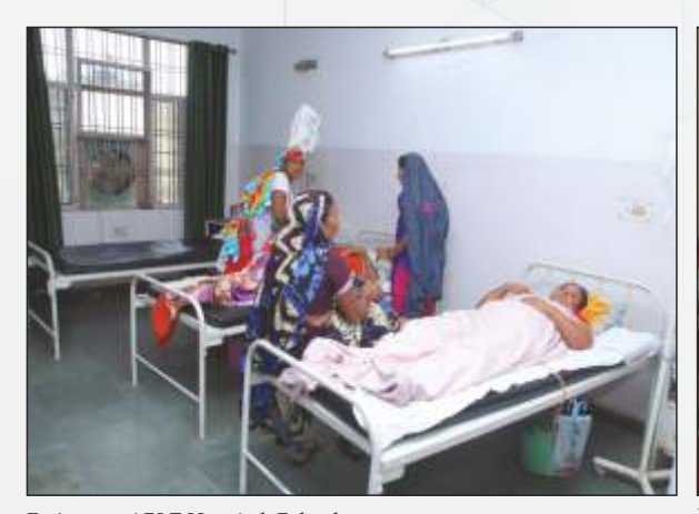
Patients at ABLE Hospital, Palwal