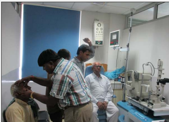
Fully equipped Dr. Dey Charitable Eye Hospital