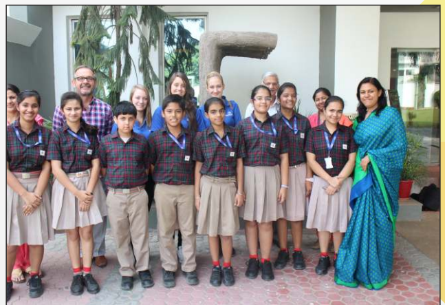
Our foreign guest at Manav Rachna International school-sec-14, Faridabad